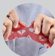
Easy to tear

The fact that the bandage is very light, does not constrict and is not sticky to touch makes it more comfortable for the animal and easy to work with for the vet and owner.